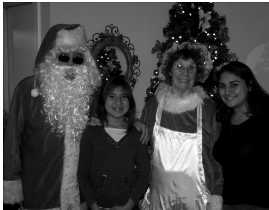
Posing with Santa & Mrs. Claus