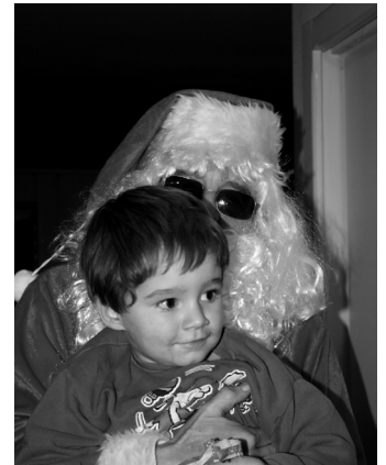
Santa loves the little folks