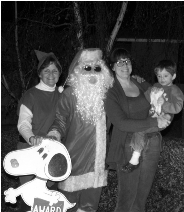
Santa and an Elf deliver awards