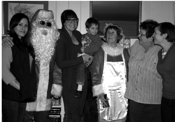
Smile for the camera!