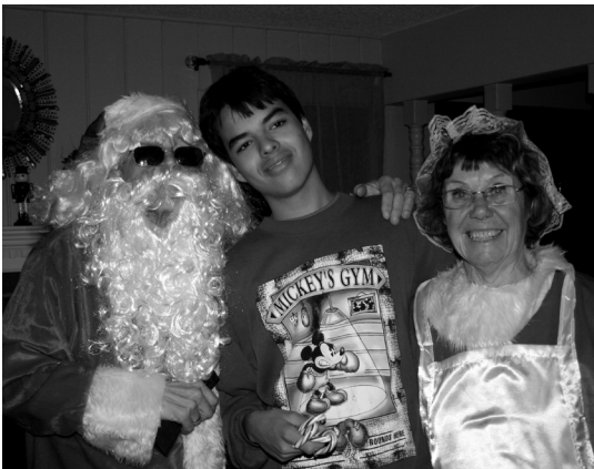
Happy to see Santa