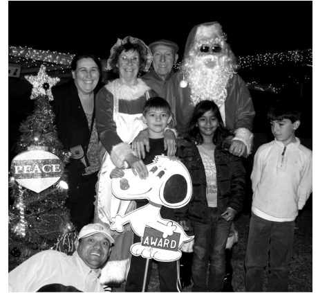
Hurray for the Snoopy Award!