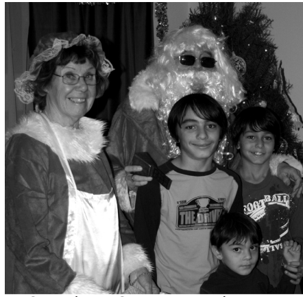
Santa loves Snoopy Award winners