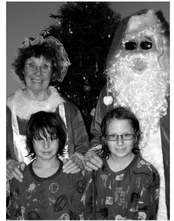
Ready for Santa to visit