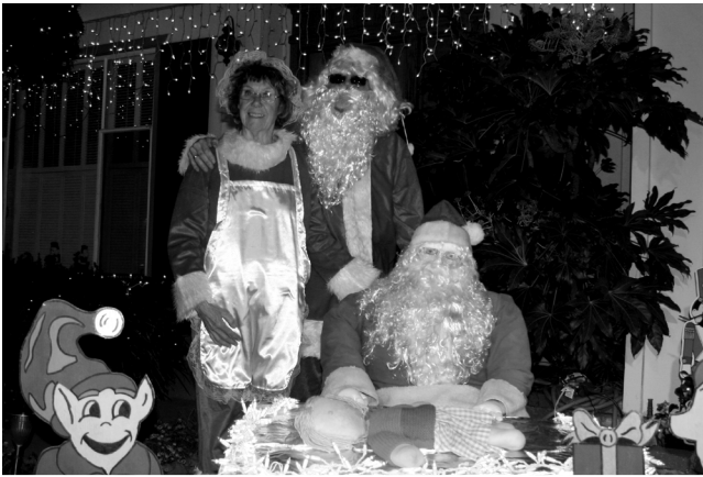
Santa poses with a statue of himself