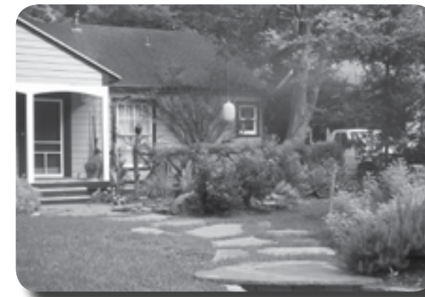
8702 San Fernando Drive