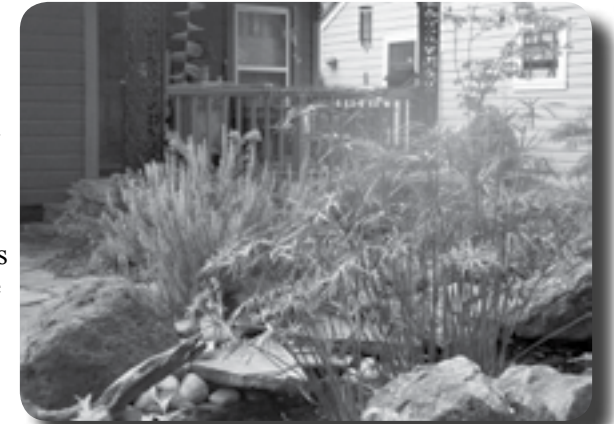
8707 San Fernando Drive

The lace-barked elm shields the wonders within, but the meandering flagstone paths draw you in. Originally grass and mud, created with passion, this garden is an oasis of peace.