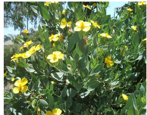
From Left to Right: Manjilla Poppy, Cleveland Sage, California Sunflower