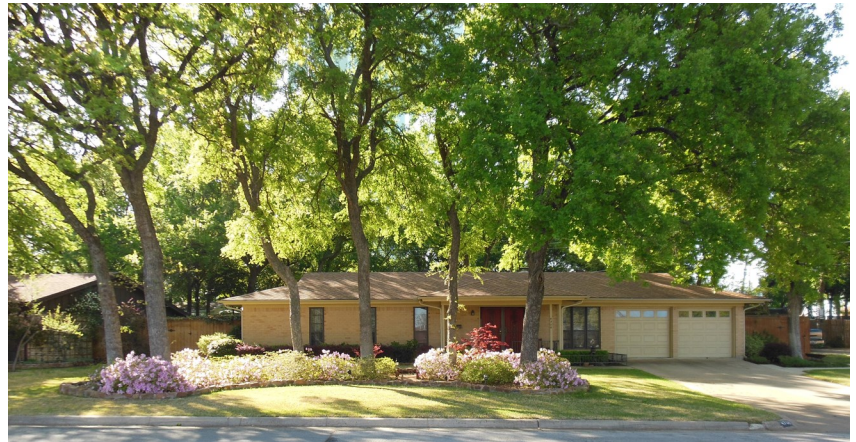
4708 St. Lawrence