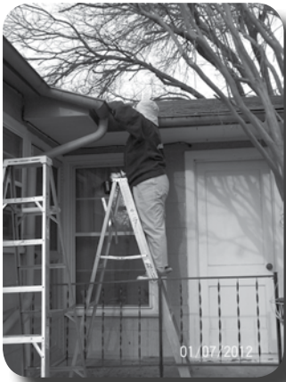
Pam Proctor cleans overhead guttering.

Since our last newsletter we have taken advantage of this wonderful weather and zipped around the neighborhood taking care of residents with minor home issues. We have cleaned gutters that were overflowing, adjusted locks on doors that wouldn't shut after the latest rain fall, climbed a roof to remove a fallen tree branch, built a walking bridge over a deep ditch, and replaced a dangerous front step that was just waiting to break someone's ankle.