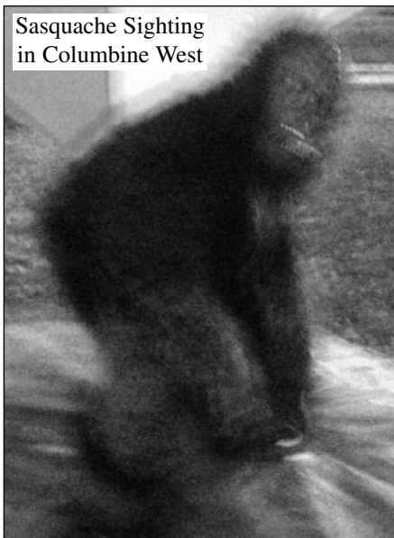
Sasquache Sighting in Columbine West