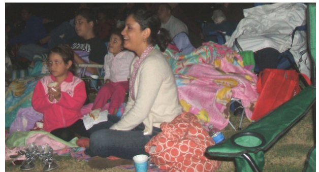
Bottom Right: Family Enjoying CARS 1 at Sept 3rd Movie on the Green at 20th & Daisy