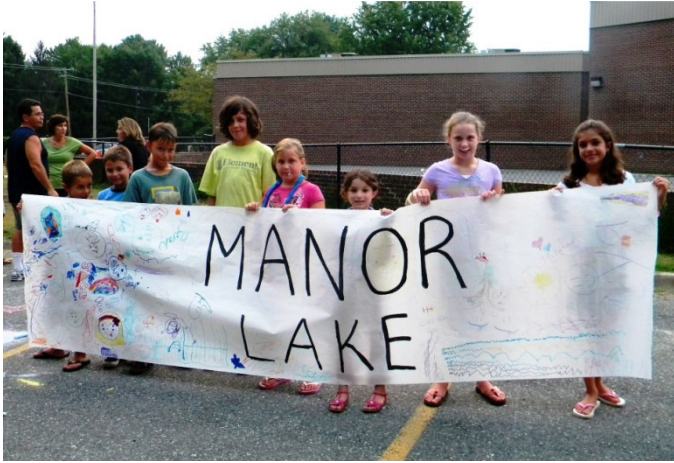
Proud residents rolled out the banner