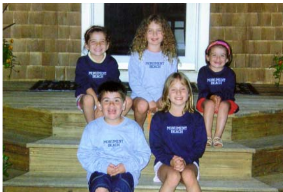
Our next generation of Monument Beach Civic Associates directors