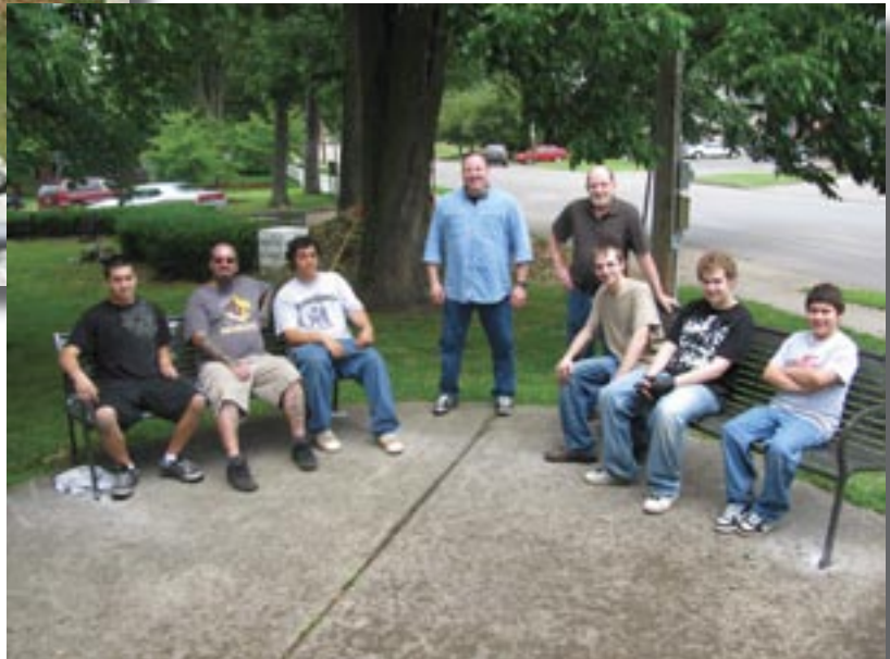
Bench Project Helpers