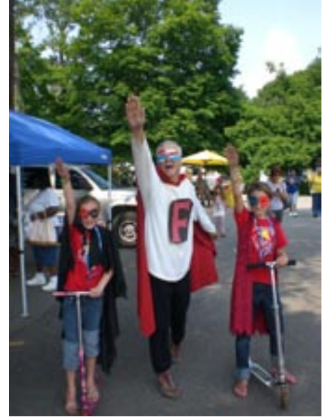
Foodman & Sidekicks