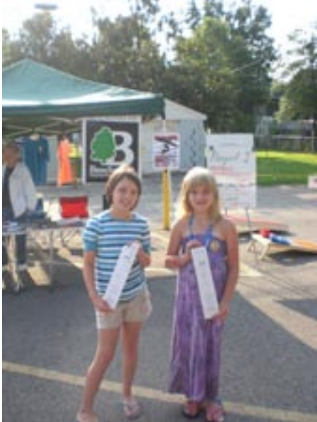
Spelling Bee Winners