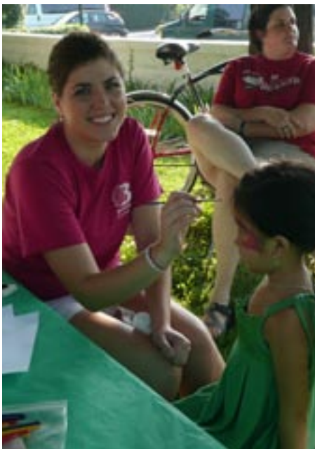
Face painting for the kids

B NA held its Annual Finishline Festival on Saturday August 8th. O'Shea's provided lots of good food and a live band "The Juggernaut Jug Band". We had lots of fun for the kids with an Inflatable, Face Painting and a Dart game. The weather was wonderful and everyone had a great time.