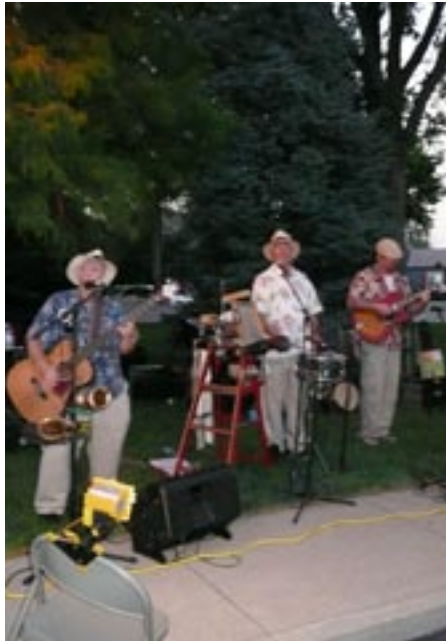
Juggernaut Jug Band