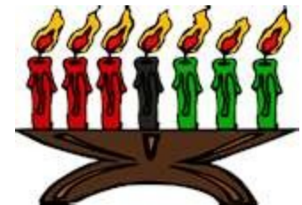
Kwanzaa Kinara Candles

Students—your career in the Federal Government starts here! We offer valuable job experience, training opportunities, excellent benefits, and opportunity for advancement. Whether you are student in high school, college, or graduate school seeking work experience or you are about to graduate and begin your career, consider Federal service! APPLY TODAY!