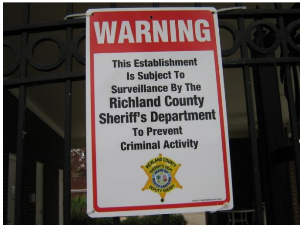
A sign has been posted in the pool area as requested by residents at a Neighborhood Watch meeting.

This will not take a lot of time, but a few committed volunteers are critical for the program to be successful! For more information, contact the board at VAH_BOD@yahoo.com