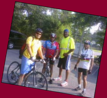
Biking in Rock Creek Park

We meet at Fort Slocum Park shelter, the corner of Kansas Ave NW and Madison St NW