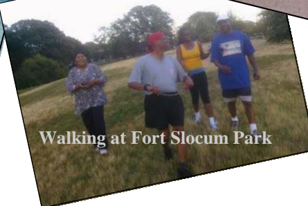
Walking at Fort Slocum Park