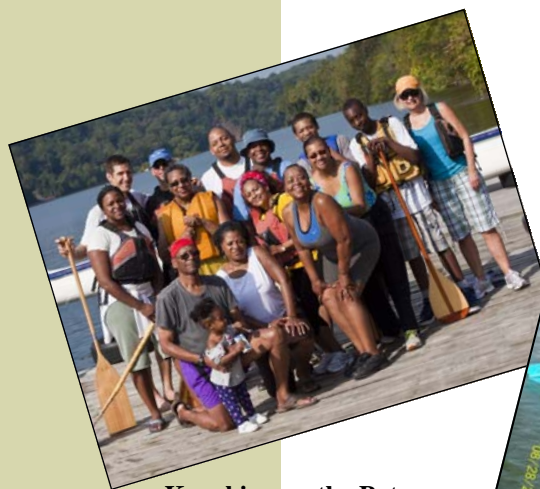
Kayaking on the Potomac

If you missed out on all of the fun SMNA members had this summer, here are some reasons to keep abreast of fun events this winter and, of course, next Spring and Summer.