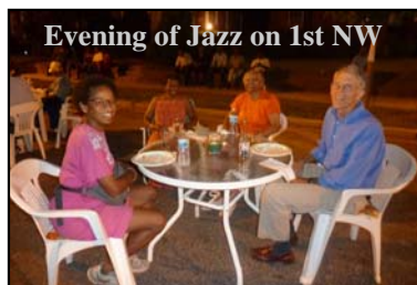
Evening of Jazz on 1st NW