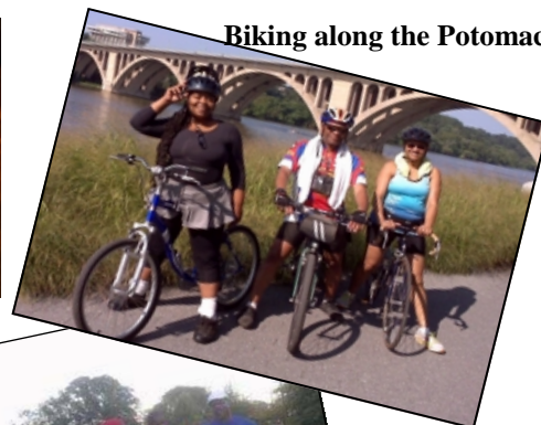
Biking along the Potomac