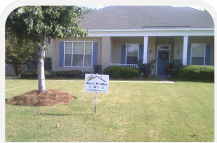
September 2010 Yards of the Month