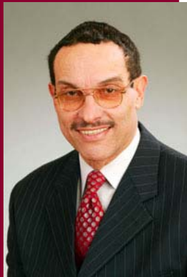
Council Chairman Vincent Gray