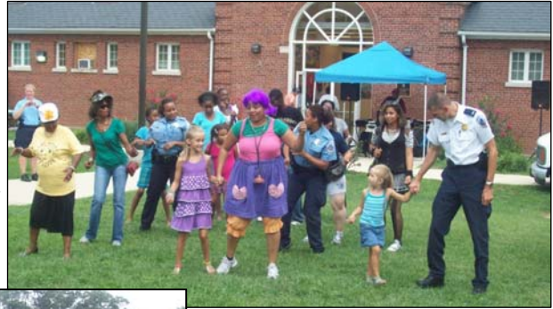
Above: Officers and neighbors partaking in a little Electric Slide fun.

other entertainment. Residents had a chance to meet their PSA lieutenants and officers. DC Lottery provided Bingo for Seniors. The event was held at the Takoma Recreation Center.