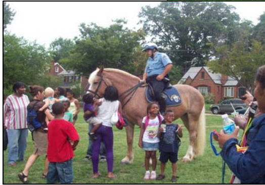
Left: Kids have fun meeting a mounted police officer and his four-legged partner.