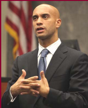
Mayor Adrian Fenty