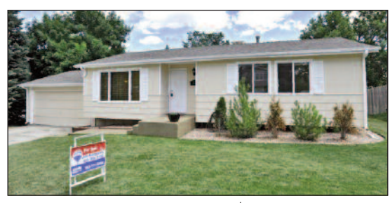
7116 W. Fremont Place • $229,900

Beautifully updated with new kitchen, new baths, wood floors, windows, finished basement and more! Great value! Contact Julie Montgomery at 303-906-3150 today!