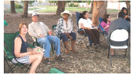
National Night Out 2009

Once again WANA will host a National Night Out Pot Luck at the Mini-Park located between West 21st & Hill Streets, west of San Francisco Avenue next to the LA River. Come along and bring a new neighbor, a lantern and remember to leave your porch light on! We'll have special guests from the Police Department and a good time! Details in July issue of WANA News & Views .