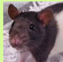
Remy the rat

Obesity in pet rats is common and it is known that pets with a restricted-calorie diet live longer. To prevent or reduce obesity, owners should limit the pet's food intake and provide cage accessories that allow play and exploration (e.g., exercise wheels, tunnels, and ramps). Owners should also supplement their pet's diet with foods high in fiber such as vegetables, limited amounts of fruit, and occasional treats.