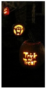
Carving talent on display at the Horstmann's