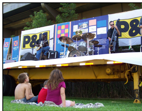
Concerts in the Park

This state trail, which spans 7 miles between the Lakeshore Path on Lake Michigan, past the Menomonee River Valley and Miller Park and ending in Doyne Park provides a great connection by foot, bike or blade to many parts of the city. These trails are a great asset to life in an urban setting by providing a place for recreation, fitness as well the chance to access many attractions and workplaces without using a car. We invite you to try out the trail or volunteer to help keep the area clean by participating in the annual Plant and Clean Day! Visit: http://www.hankaaronstatetrail.org for more information.