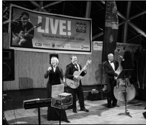
Under the Glass: The Domes' live music shows on Thursdays resuming in the Fall

¿Cuándo fue la última vez que visitó los Domes? Con la instalación reciente de un nuevo sistema de iluminación, estos iconos históricos ahora iluminan el horizonte nocturno de Milwaukee. Los ofrecen no sólo un destino para la noche sino una toda nueva experiencia conservatorio. ¡Acompañanos!