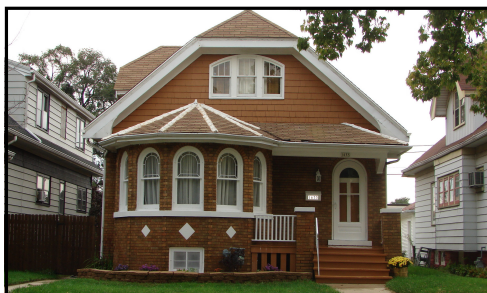
Home of Neighbor, Dawn Maurice, 2008 Contest Participant

Gane premios hasta $1,000 con proyectos de mejoramiento de su casa! Llame a Chelsey para más información al 383-9038 x. 2305.