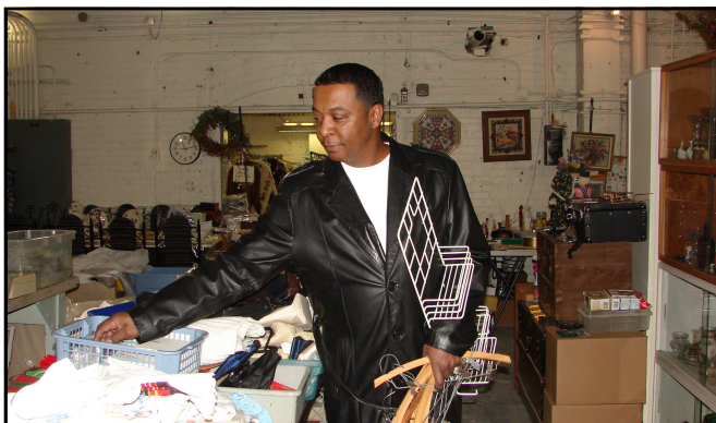
Shopping for deals at the Last Stop Shop