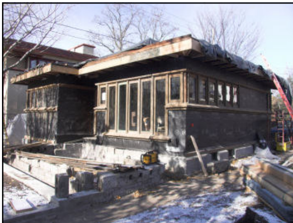
A work in progress: Frank Lloyd Wright's Model B1 home near the corner of Burnham St. and Layton Blvd.

The Layton Boulevard West Neighborhood has the honor of being home to six unique American System Built homes, designed by Frank Lloyd Wright. The American System Built homes were designed by Wright to be an affordable option for low to middle income families. Many visitors from all over the world come to our neighborhood to see these unique homes designed by a world-renowned architect.