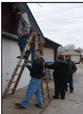
Neighbors working together on the Solar lighting project

Era exactamente lo que anidábamos buscando. Los hogares de este vecindario son hermosos y tienen tanto carácter. Me encanta mi hogar y los vidrios especialmente. Me hace alegre cuando la gente toma el tiempo para mantener sus casas históricas. Cuando lo hace, emite un sentimiento orgulloso por nuestro vecindario. Este año, pinté todo, instalé pasamanos, puse una cerca y semilla en la yarda y también planté flores anuales en el jardín. Me encanta el sentimiento hogareño. También, hay tantos restaurantes muy buenos. El Cabrito (29 th y Greenfield) es una taquería muy deliciosa y barata que mi familia y yo frecuentamos. ¡Esta área está cerca de casi todo lo que quisiera hacer!