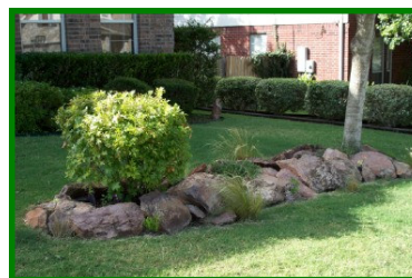
1505 Red Cedar Cove

A low rock sculpture in the yard is both very natural looking and magnificent. The lawn is well maintained. If this yard had more color, which is one of the grading criteria, it may have placed higher. Nice job!