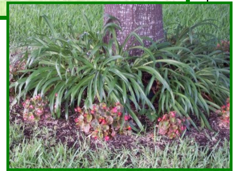
2917 Greenshire Drive—Yard of the Month

A beautiful and professional looking landscape harmonizing colored mulch with the brightly colored shrubbery. Every detail looks planned and well maintained. Nice touches with red iron chairs in planting bed and large pottery vases at front door. This yard scored high on the three grading criteria of lawn, color and creativity.