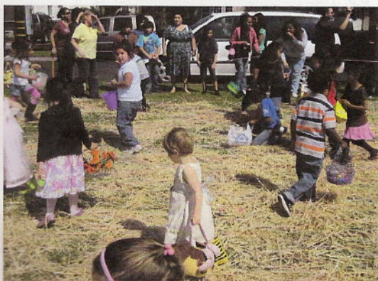
Get on your marks, Get set, HUNT!! 2-6 year olds (above) and 7-12 years (below) had fun looking for eggs covered with straw.