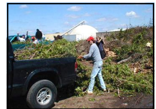
Chouteau Leaf and Brush-Drop Off Location

For additional information, please contact the KCMO Action Center by dialing 311 on your phone.