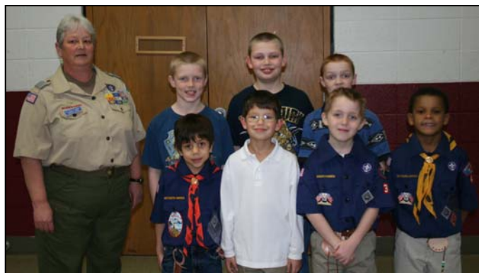
Scout Pack 33 presented the colors at our March meeting.