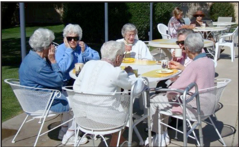
Coffee in the Park on April 4

All residents are encouraged to participate in the auxiliary committee; it is no longer just a “women’s club.” Contact Kitty if you are interested in hosting an event or contributing cookies or other treats. Take a moment now to submit your annual dues ($6) and to complete your membership form (see below).