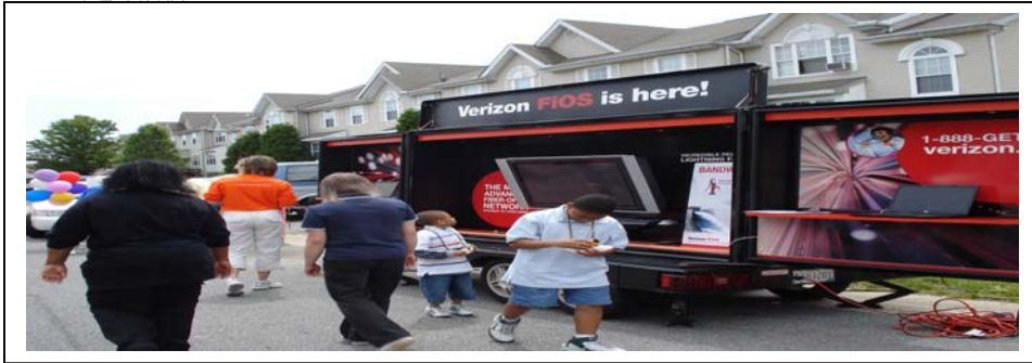
Briargate – Verizon Block Party 2008