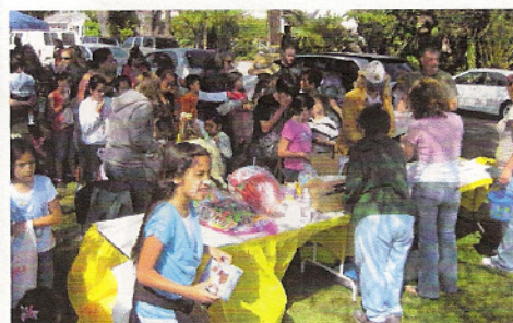
Easter Egg Hunt Registration