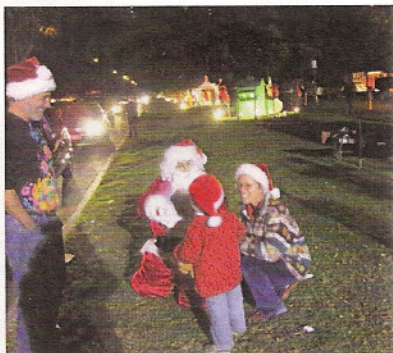
Santa Visits the Lane on Entertainment Nights