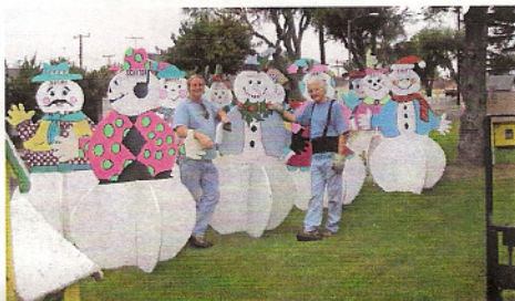
Setup Day on Christmas Tree Lane