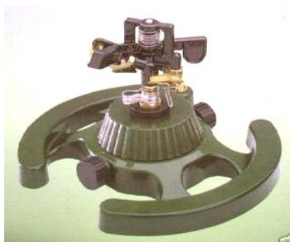
Home Depot Impulse Sprinkler