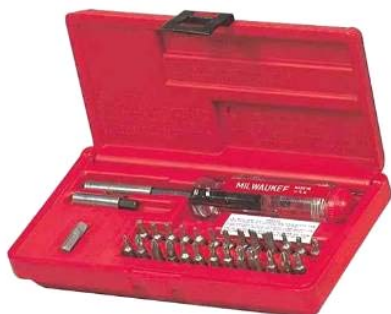
Vermont American 29 pc Screwdriver & Insert Bits