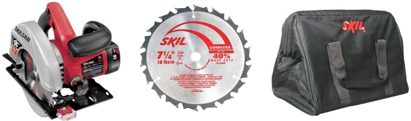
Skil 5800-02 18V Cordless Circular Saw Includes 7 1/4" thin-kerf carbide-tipped saw blade, 1-hour charger & carrying bag

With this being the last SSNA neighborhood meeting of the year, we dug deep into our prize closet and pulled out our best remaining prize. As shown above, some lucky attendee will win an 18-volt cordless circular saw and accessories. This will make a great holiday gift or keep it for your lucky self. Any attendee 18 years of age or older at Sunday's meeting is eligible for the prize drawing. The drawing will be held at end of the meeting. Don't be late! Congratulations to our neighbor in the 100 block of W. Ormsby who won a cordless drill at the October meeting!