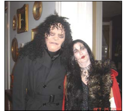
Two escapees from Project Runway attended SSNA Halloween Party