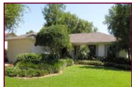
Executive Pool Home $599,900