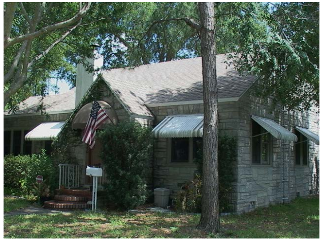
Fig ivy and mosaic tile highlight the brick stoop of Larry and Joyce Wissing's stone tudor, built in 1937. The inside of the home has as much character as the outside.

The center piece of the living room is a fireplace framed from wood found in an old railroad station. All of the oak doors have the original glass globe doorknobs and are in good working order.