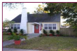
Home w/apt & guest quarters $204,900