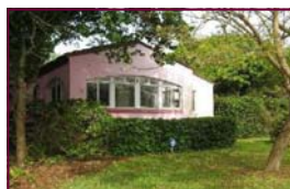
Spanish Home w/pool $400,000