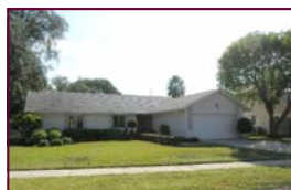
New Price/4br, 2ba $265,000