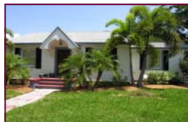
3br, 2ba pool home $312,000