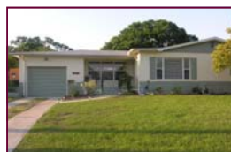
2br, 2ba, w/patio & Pergola $215,000