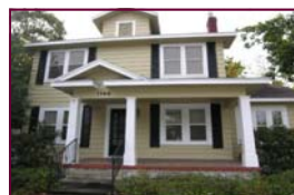
Charming 4br, 2ba $359,900