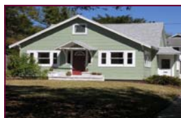
2br, 1ba Cottage $229,900