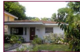
2br, 1ba, 1 car garage $225,000