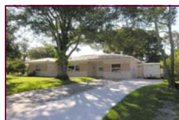
Updated 3br, 2ba $239,900