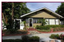
2br, 2ba Bungalow $255,000