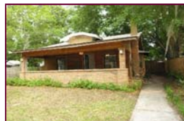
3br, 1ba w/fireplace $224,000