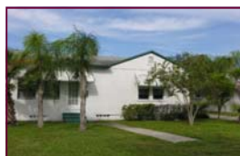
2br, 3ba w/family room $199,900