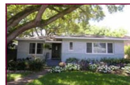
New Price/3br, 2ba $249,000