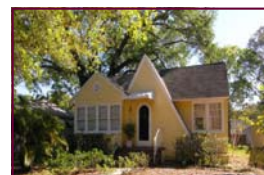
English Tudor w/4br, 2ba $245,000