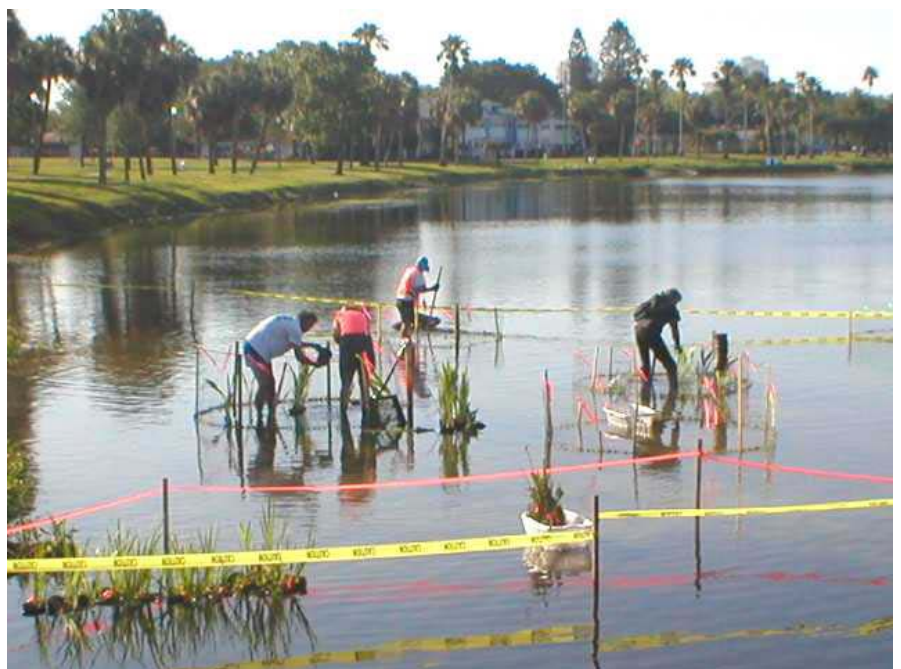
EARTH DAY AT CRESCENT LAKE: Local volunteers get their feet wet during the April 21 Earth Day event at Crescent Lake. The plants, all Florida Native species, are part of a large initiative to make Crescent Lake a healthier, more bio-diverse body of water. See pages 8-9 for an update and photos of our neighborhood's major 2007 project.

So, please, help us. If you haven't paid your dues, please take a moment and send in your dues with the enclosed envelope. If you already have, we thank you.