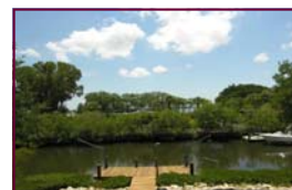
Waterfront w/dock $849,900