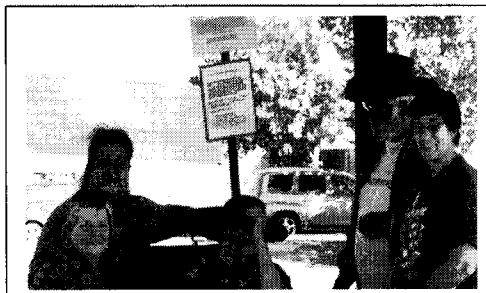
Tree Planting at Bill Bean Jr. Park