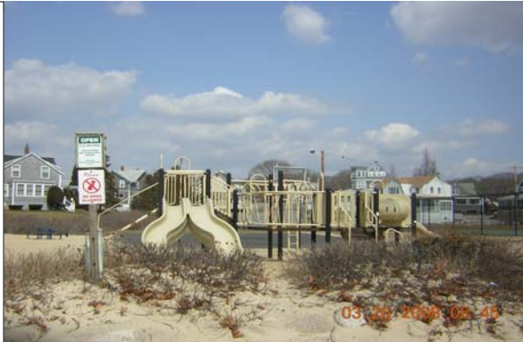
CHESTER PARK RENOVATIONS