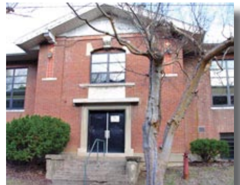
Beechmont Community Center