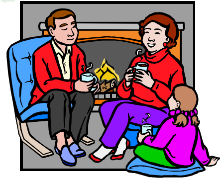
Simple Family Traditions Mean So Much More When Seen Through the Eyes of Children

No matter what the activity is, make sure