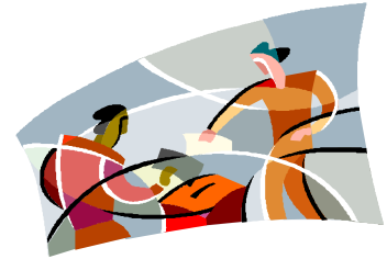
Current Members Votes Count - Are You Current?

Plan to attend this meeting in order to gain a thorough understanding of the events that will impact you and your neighbors