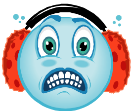
Prevent Freeze Damage With Insulation