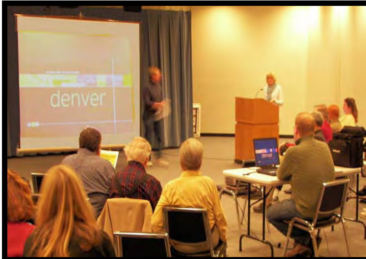
The Downtown Area Plan is presented to the INC Delegates.