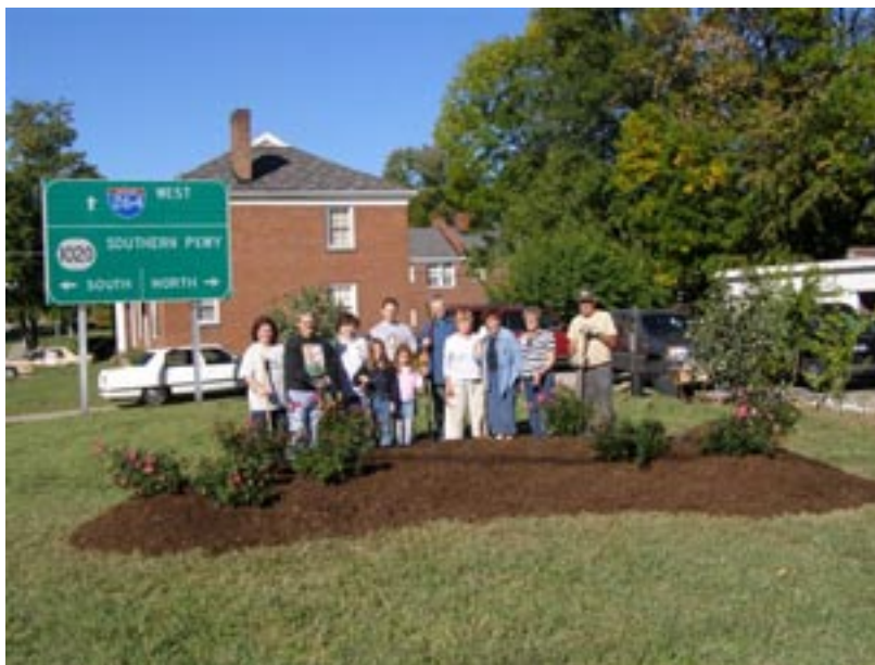
BNA's Third and Florence Landscaping Project

those neighbors who helped with gazebo landscaping and maintenance. Thanks to all those who attended the mass meeting on neighborhood safety at the Iroquois Library earlier this year. Your input was important. We now have a security guard on a regular basis and some beautiful landscaping at the front entrance. The library staff is working hard to keep the Iroquois branch an enjoyable place for all to use.