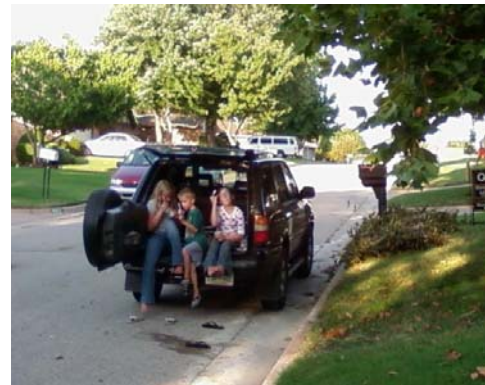
Eating ice cream in back of the SUV