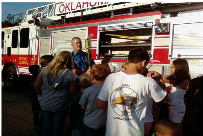
Checking out the fire trucks