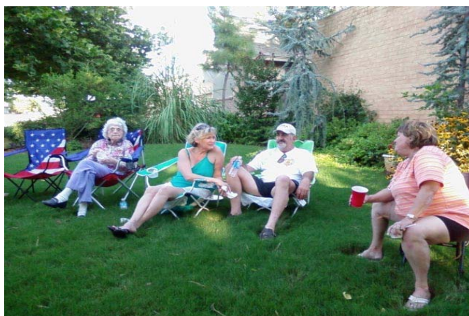
Visiting with friends