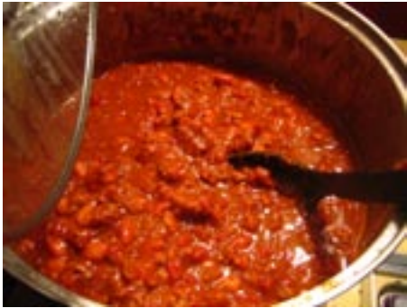
Firehouse Chili !

The Beechmont Neighborhood Association's Annual General meeting will be held at the Ashland Avenue Firehouse at 5th and Ashland on Monday November 17th at 6PM. This is the meeting when we elect Board Members for 2009. We need a few good people to serve as Board Members and Officers to keep our Neighborhood Association strong and vibrant. Come out and share Chili and Hotdogs with us, courtesy of our brave Beechmont Firefighters. This meeting, as all of our meetings is open to the public and is completely free. If you are a member in good standing you can vote for Board members or run for the Board yourself.