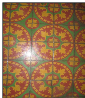
Jose Mojica Hacienda Encaustic Patio Tiles