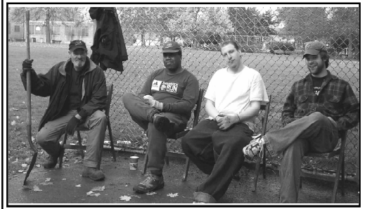
Waiting for some business