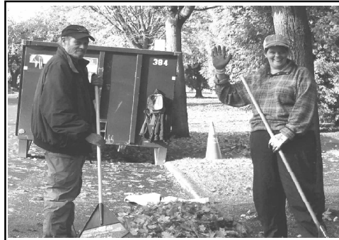
What a beautiful day!