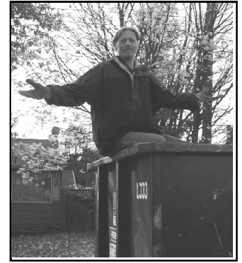
"Great view from up here!"

Pictured are just a few of our volunteers and mostly from JOIN. The day turned out to be completely rain-free so many neighbors took advantage of the event sponsored by the neighborhood association and Metro. THANK YOU to all those that volunteered and brought your junk!