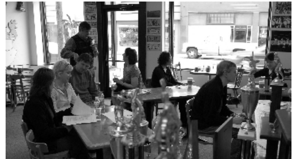
Montavilla Farmers' Market volunteers meet at Flying Pie Pizzeria to discuss planning and details of the market.

There will also be four fundraising events in which two restaurants will donate a percentage of diners' tabs to the market: April 30th and June 4th (any time) at Flying Pie Pizzeria and May 21 and July 16 at the Burgerville at SE 82nd and Glisan (5 p.m. to 8 p.m.). Contact montavillamarket.marketing@gmail.com for more information. ■