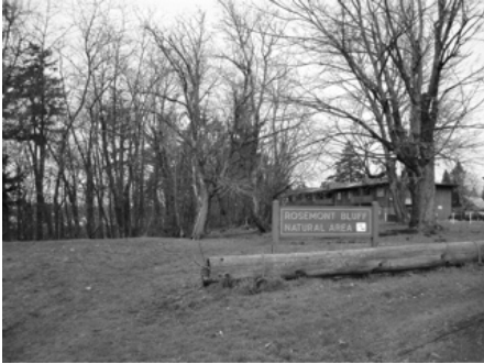
Rosemont Bluff in the Center Neighborhood