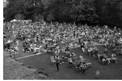
Mt. Tabor Summer Concert in the crater. August 2006

The Montavilla Neighborhood Association is a sponsor of the Mt. Tabor Summer Concerts, which take place on Tuesdays in July (after the Fourth). A number of Portland Parks hold these free events for communities to