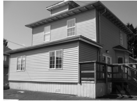
A view of the new Africa House

Refugees are people who flee their country due to war, persecution, disaster or fear of torture. The U.S. Congress permits refugees to reside in the United States. Africa House, which moved to Stark Street on February 20th, is a program of IRCO - Immigrant & Refugee Community Organization. Africa House serves Africans with refugee status by offering life skills training and workshops, referral services, support groups and much more.