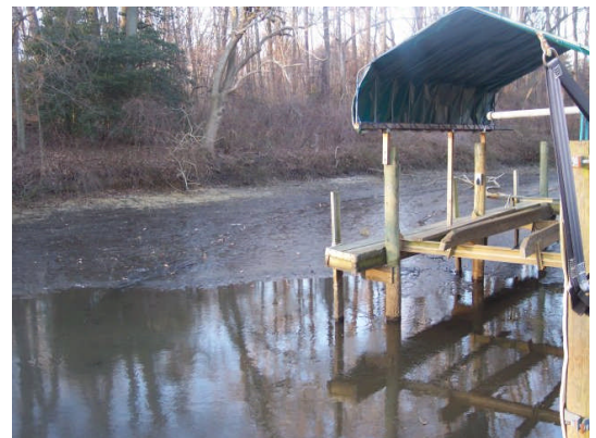
Photo: evidence of silting on lower creek branch from the upstream culvert near PPCA Community Lot.

T he Board of Directors will consider making Community Association endorsement, based upon the amount of advance notice, clear details and appropriateness of the purpose, of resident's proposals for organized activities such as a Golf Outing, Fishing Tournament, or any similar recreational event open to the PPCA members. If a member is willing to organize any of these types of recreational activities, the 2007 Board wants to hear from you.