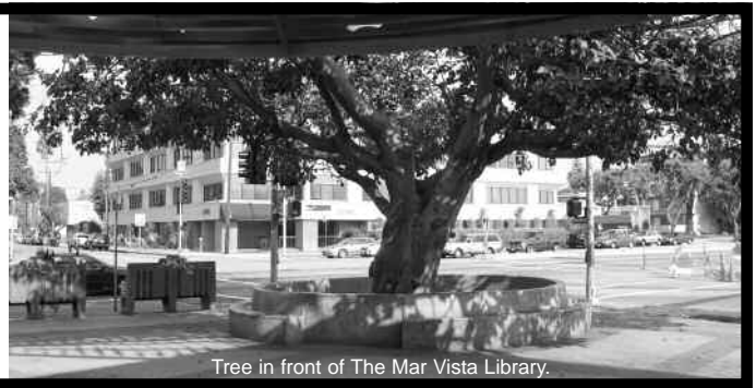
Tree in front of The Mar Vista Library.

South Mar Vista Neighborhood Association