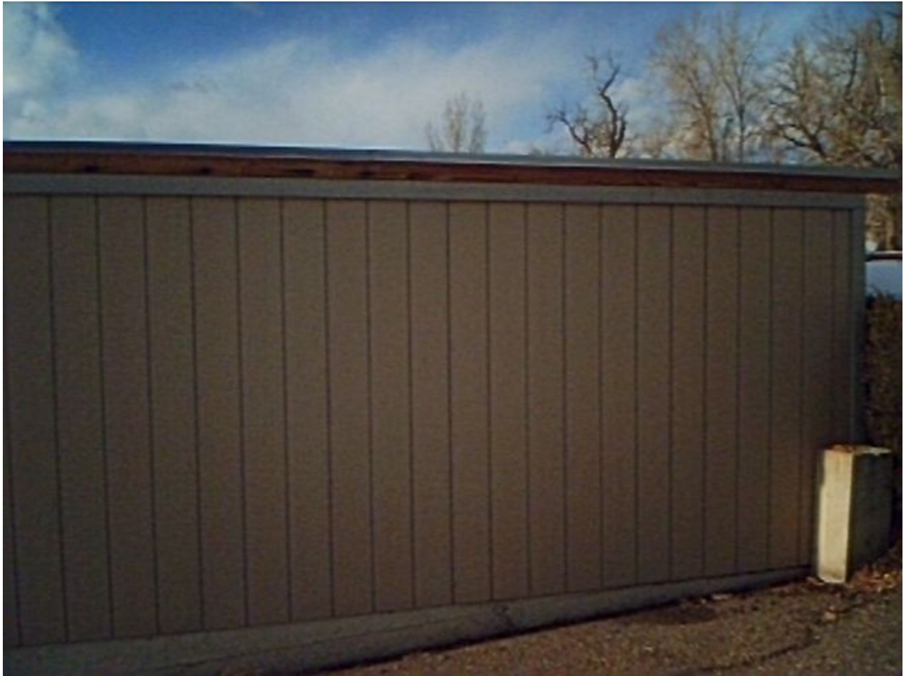
Unfinished Wood trim installed by Maintanance and allowed to decompose