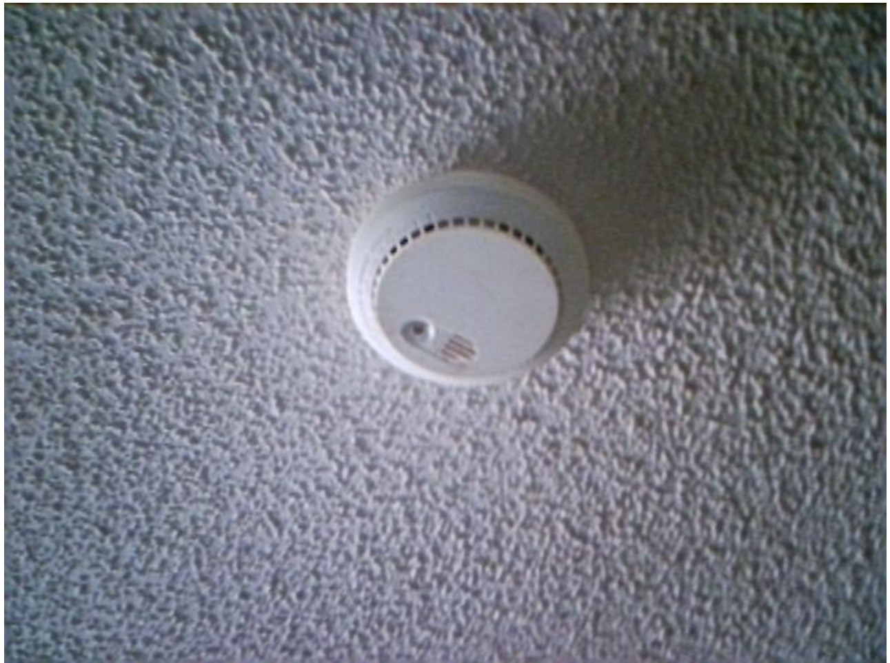
Building 50 that had fire is found to have a Dead Smoke Detector–South End Top Floor