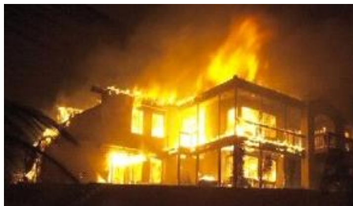
A burning home in Ramona during the October 2003 fire

A "Red Flag Warning" has been issued in San Diego County today due to dry, hot temperatures and high winds produced by Santa Ana conditions. The red flag warning is to alert us to be extremely careful as all elements are conducive to a high probability of wild & canyon fires, like the Chino Hill burning this morning. Please be mindful, as this summer is going to be a "dry" one. With such environment, we need to be extremely careful, alert and safeguard our canyon bordered community from wild fires. Not to mention, all those fires started by children at play with fire ignition devices. Above all, DON'T allow your children [teens included] to play with matches, fireplace and BBQ lighters at all! Instruct them about the need to keep us all safe and enlist their cooperation to help prevent fires and all the tragedies associated with it.