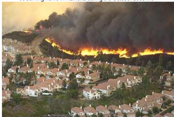
Flames approaching Scripps Ranch, October 2003