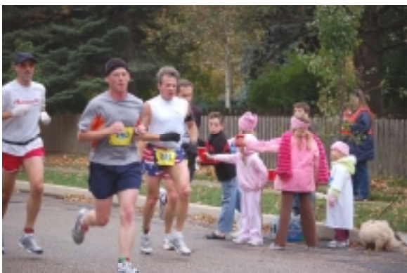
IPNA neighborhood kids hand out water to Des Moines Marathon runners in October.