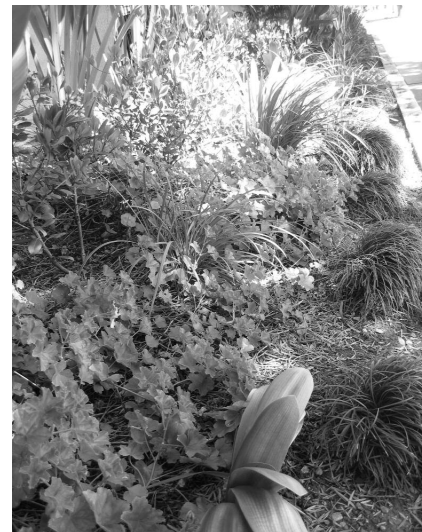
A beautiful garden in South Mar Vista

Solar cells, which are made of silicon, convert the sun's energy into DC, or direct current, electricity. The DC current is converted into AC, alternating current, providing a clean form of energy to power homes and businesses.