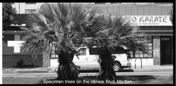
Specimen trees on the Venice Blvd. Median

South Mar Vista Neighborhood Association