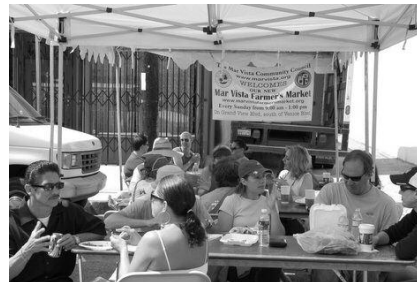
Attendees enjoy nachos, crepes and fresh baked goods every Sunday the Farmers Market

The Mar Vista Farmers' Market, a non-profit organization, was formed by a small group of residents, shop owners, and local professionals. The market aims to raise money to support the Mar Vista community. "We are excited and enthusiastic to