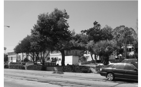
The current median shown here was designed and planted over 20 years ago.