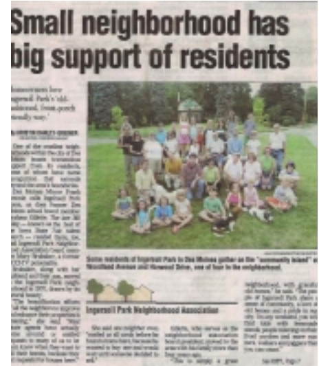
The Ingersoll Park Neighborhood Association was featured in the Des Moines Register on Tuesday, July 25th. Our photo was taken on the monument island.