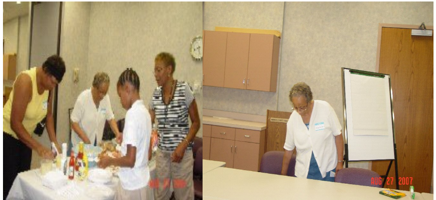
First Meeting for KMNA Study Circle