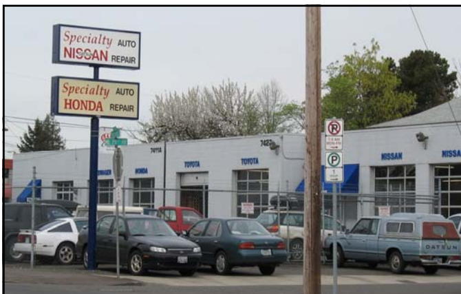
Specialty Auto - Import Auto Service